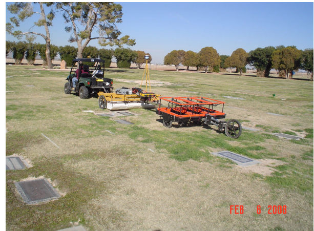
Above: TerraVision II® GPR and MetaVision II® TDEM systems used together to collect data.

The UIT 14 channel TerraVision II® ground penetrating radar system, and MetaVision II® a multi-sensor time domain electromagnetic induction unit were towed in tandem to collect data over the survey area. A Navcom global positioning device was used to continuously track instrument positions to decimeter accuracy. GPR, TDEM, and GPS data were integrated with the UIT DAS software. Final results were obtained by overlaying air photography, survey plates and geophysical data within the proprietary SPADE® software.